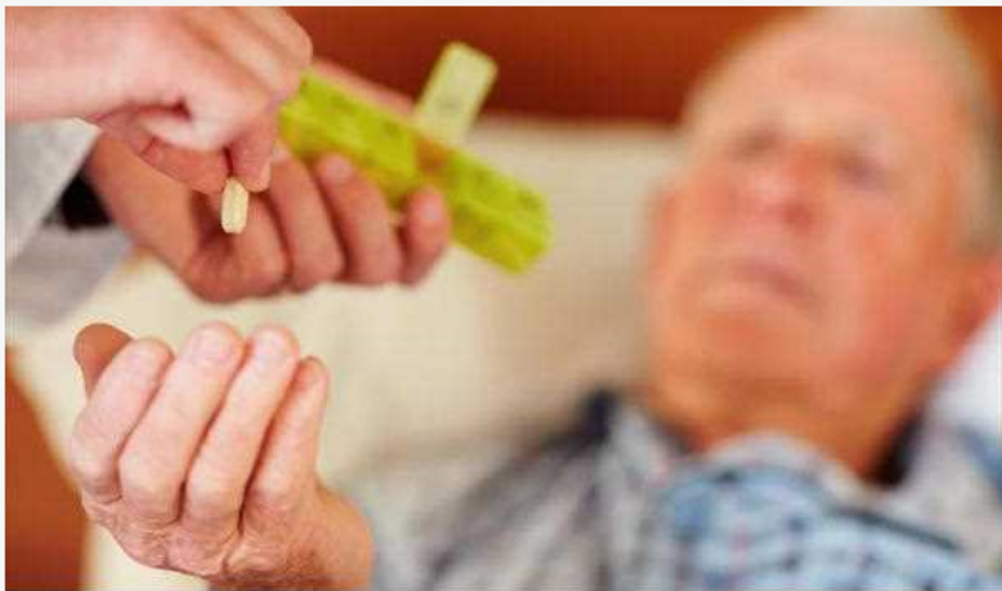
GoutGout PatientsGout TreatmentNatural GoutUricUric

Relies on the size, quantity and place of tophi in the gout patient body and gout patient compliance with gout treatment. Febuxostat has success after the three years of tophi treatment.